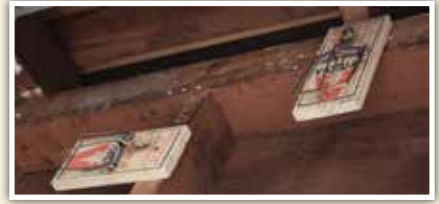
Proper trap placement on beams and rafters (note rub marks on beams indicating rat trails)

It is important to check the traps daily to remove dead rats and refresh bait. Ectoparasites, such as mites and fleas, may move from the dead animal and its nesting material to people or pets. It's important to remove the traps daily and to properly clean the area. Please see the Clean Up section on page 13 of this booklet.