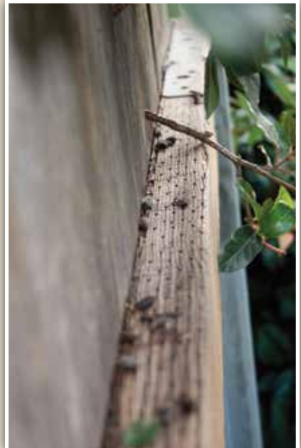
Droppings on fenceline rails