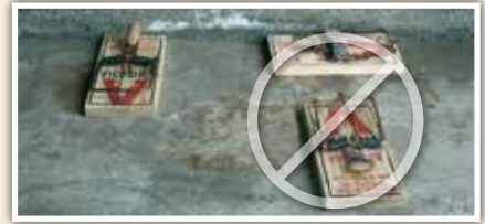
Properly placed trap at floor level vs. improperly placed traps