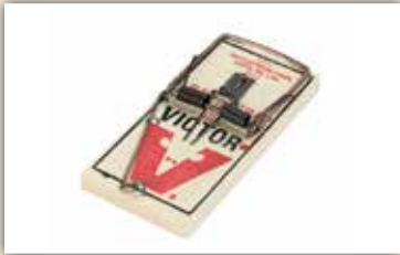
Wooden snap trap

Rodent “snap traps” are inexpensive and are available in two sizes. The smaller trap is designed for mice and the larger is designed for rats. It is very important to choose the proper size trap. Several rat traps should be set to maximize trapping effectiveness.