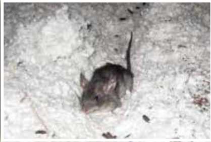
Rats often use the same trails repeatedly*