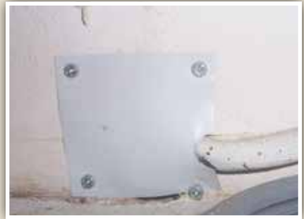
Power supply hole sealed with metal flashing*