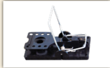
Power spring trap