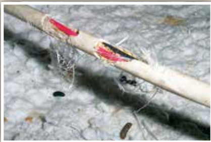
Gnawing on wires with droppings*