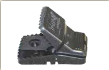
Easy/quick set trap