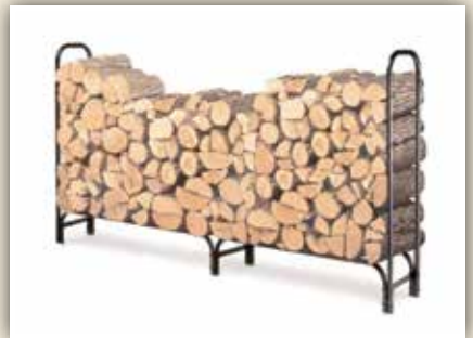
Firewood stands are practical and easy to use