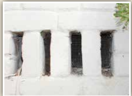
Check to make sure house foundation vent mesh is securely in place