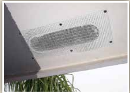
Soffit vent hole covered with screen*